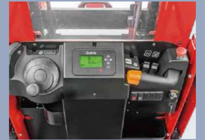
The FREE accelerator lever with sensor switch, as standard configuration, can prevent mis-operation during the work