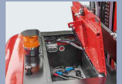
The rear hood can be removed easily to facilitate maintenance work on parts such as hydraulic unit, electronic control system and the motor