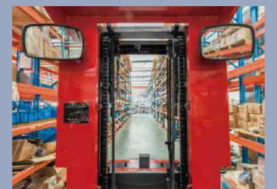
Better vision for operation