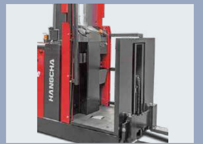
Order picker works only when the side barriers are all lowered