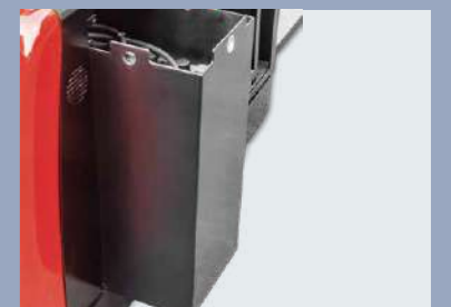
Battery side roll out